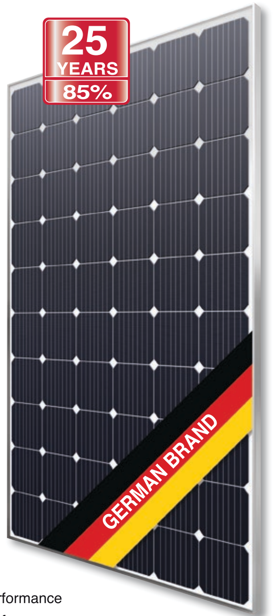
Fig. similar 60M156EN170717A

Exclusive linear AXITEC high performance guarantee!