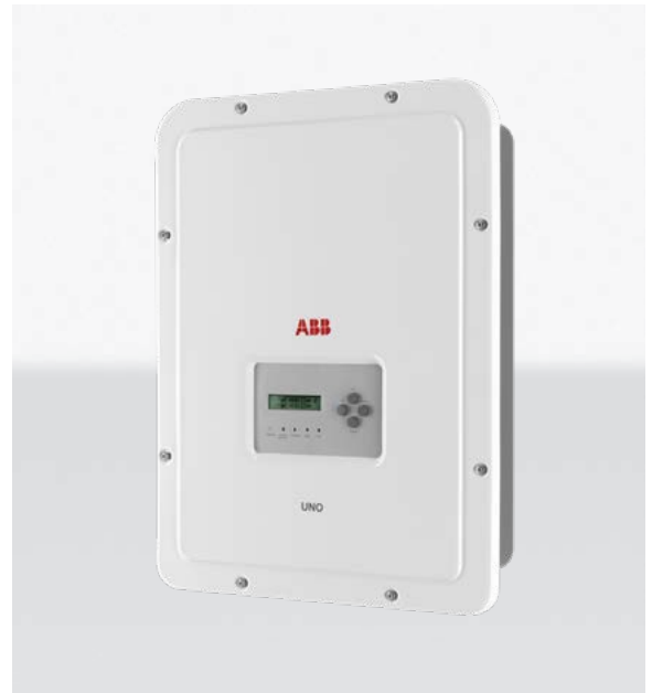
ABB string inverters UNO-DM-1.2/2.0/3.0-TL-PLUS 1.2 to 3.0 kW